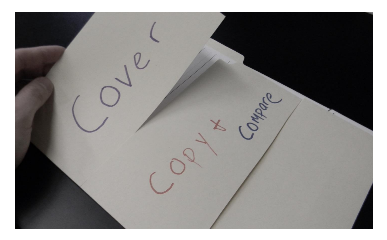
Figure 3. An example of a cover-copy-compare folder

Another way to encourage memory retrieval is to schedule time for cumulative practice of previously learned letters. For example, letters learned the previous week can be orally presented (i.e., "Last week we wrote the letters a , h , p , and r . Write the letter a five times on the first line. Raise your hand when you're done."). Handwriting speed can be emphasized with these activities by requiring students to write previously learned letters quickly and legibly within a specific period of time. For example, present a cumulative list of all previously learned letters and give students 1 minute to copy the list as many times as possible. At the end of 1 minute, count the number of legibly written letters. On subsequent timings, have students try to improve their score.